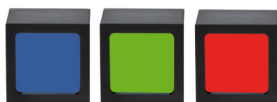
Pulsed High Power LED Cubes